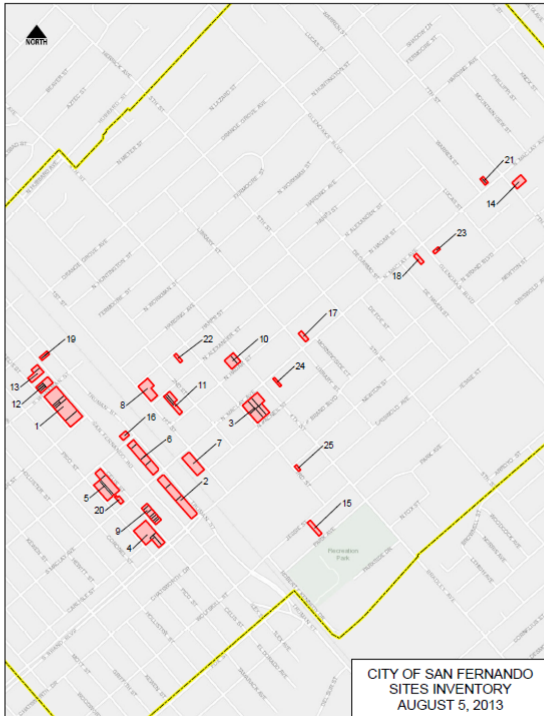
Figure 3: Residential Land Inventory