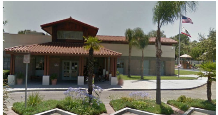
Casa de Lopez Adobe 1100 Pico St.

The City of San Fernando has seven parks, three of which have facilities or community centers. All facilities are within a 2-mile radius and accessible from public transit.