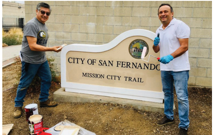
COMMUNITY MEMBERS PAINTING THE MISSION CITY TRAIL SIGN DURING THE COMMUNITY CLEANUP EVENT