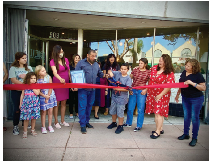
BODEVI WINE AND ESPRESSO BAR GRAND OPENING