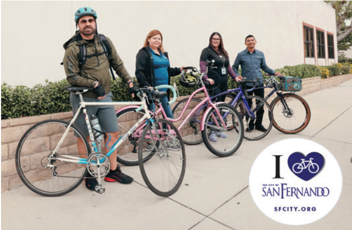
CITY STAFF PARTICIPATE IN BIKE TO WORK WEEK 2022