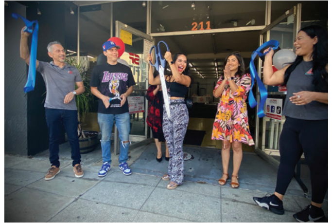
SAN FERNANDO FITNESS GRAND OPENING