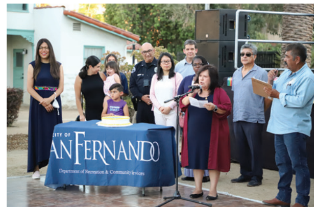
CITY'S 111TH BIRTHDAY CELEBRATION