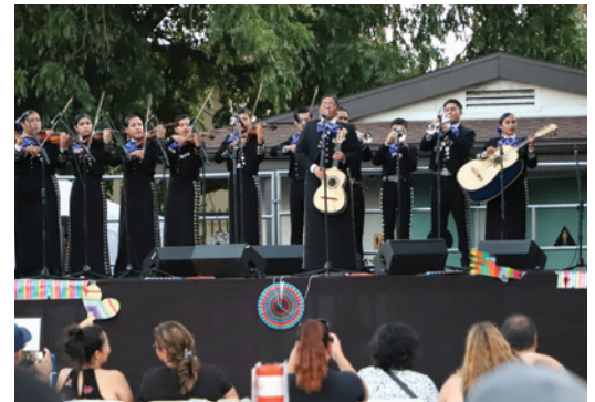
MARIACHI BAND AT DIA DE LOS MUERTOS EVENT