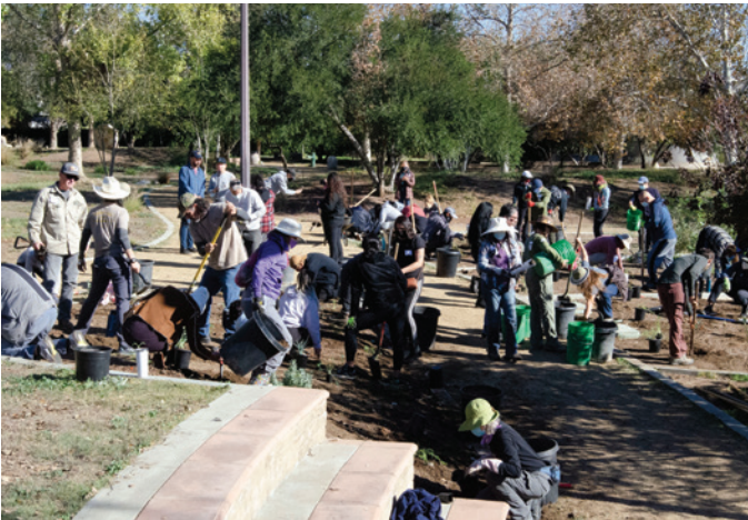
RESIDENTS PARTICIPATED IN A CLEANUP EVENT AT RUDY ORTEGA SR. PARK