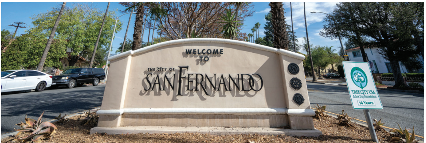
THE SOUTH GATEWAY TO THE CITY OF SAN FERNANDO

The City developed the San Fernando Beautification Program and mailed an informational postcard to all San Fernando residents illustrating the City's property maintenance standards. The City Council also approved adding one additional community preservation officer to enforce property maintenance standards and drought watering restrictions citywide.