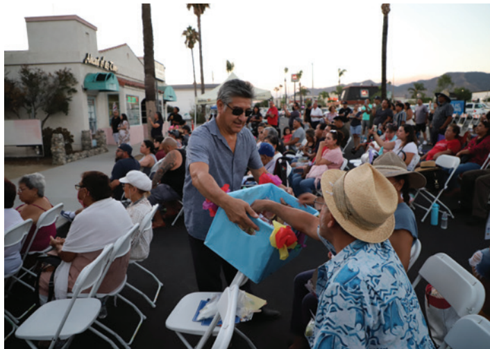
CITY'S 111TH BIRTHDAY CELEBRATION