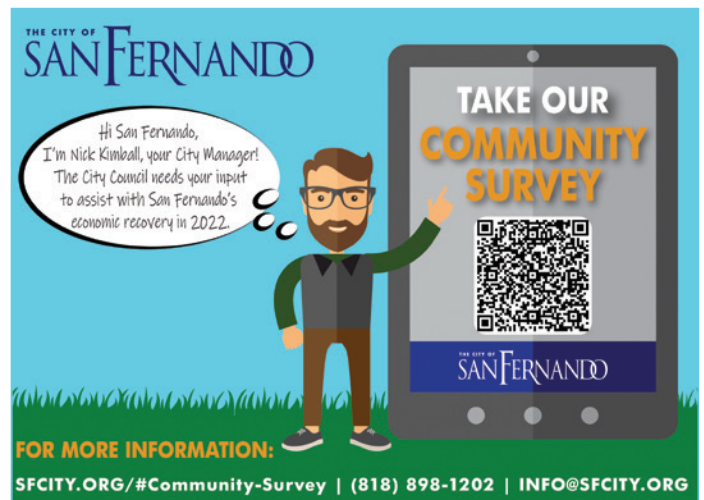
PROMOTING THE ANNUAL COMMUNITY SURVEY