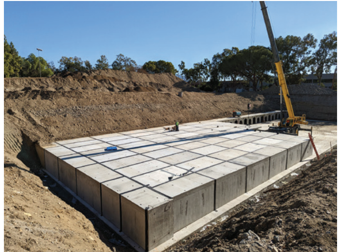
THE CITY CONSTRUCTED A NEW WATER INFILTRATION SYSTEM

The City awarded construction contracts for work to begin on the Sidewalk Repair Project and the Glenoaks Bridge Fencing Project. Construction is expected to be completed in 2023.