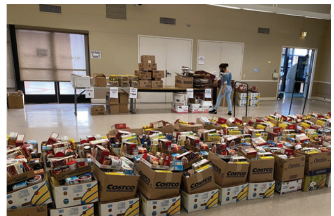
RECREATION PARK AS A FOOD DISTRIBUTION/EMERGENCY HUB