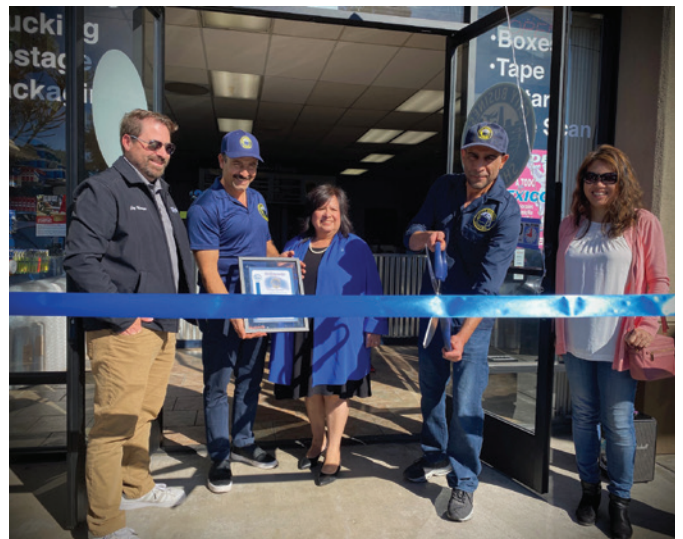
CITY BUSINESS SHIPPING GRAND OPENING