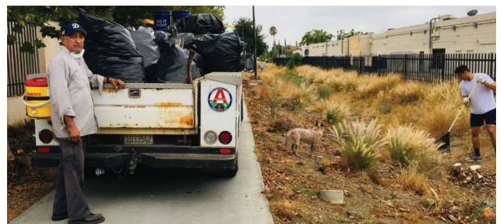
MISSION CITY TRAIL CLEANUP EVENT