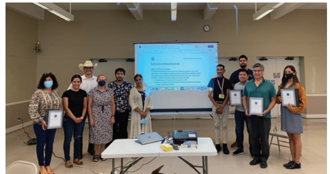
COMMUNITY RESILIENCE SERIES PARTICIPANTS