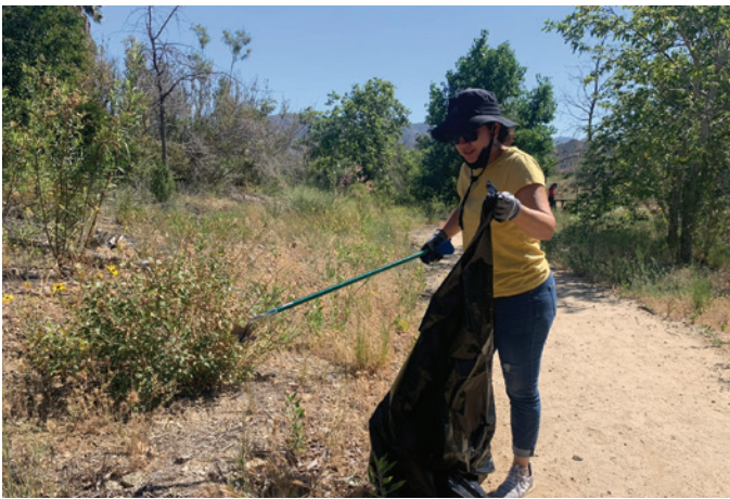
COMMUNITY VOLUNTEERS AND CITY PUBLIC WORKS CREWS PARTNERED TO CLEAN AND BEAUTIFY THE PACOIMA WASH NATURAL PARK