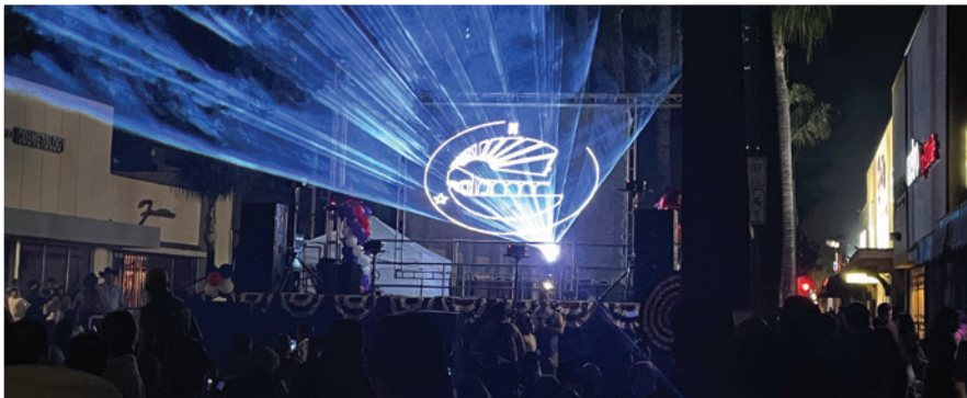
THE 'RED, WHITE & LIGHTS' LASER SHOW AT THE SAN FERNANDO MALL

The City adopted a Homelessness Action Plan to lay the groundwork for assisting individuals experiencing homelessness with a path to housing and support services.