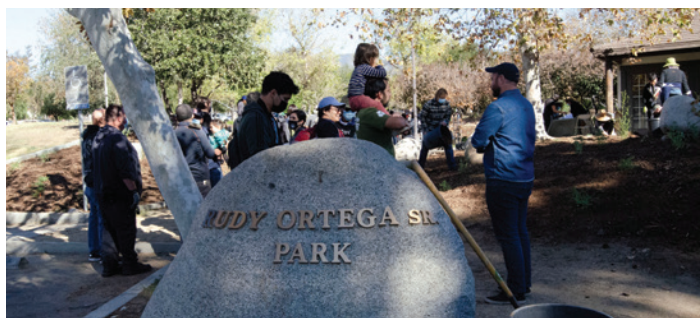
COMMUNITY WORKS TOGETHER TO MAINTAIN ORTEGA SR. PARK