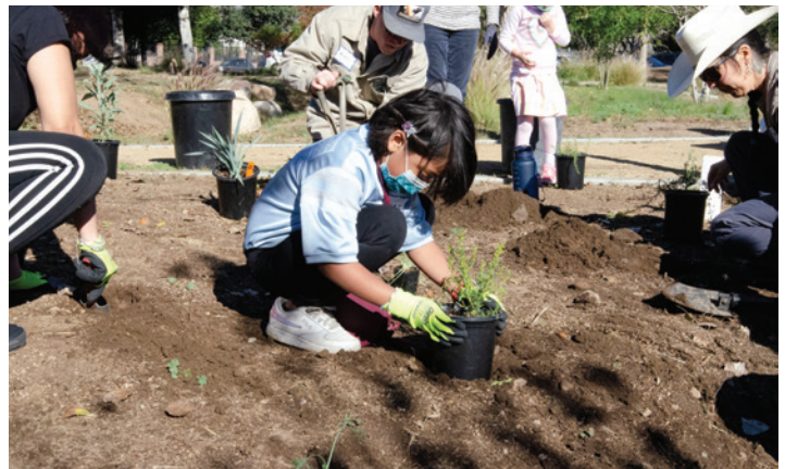
THE NEXT GENERATION OF SAN FERNANDO RESIDENTS PLANT TREES THAT WILL PROVIDE CLEAN AIR FOR GENERATIONS TO COME