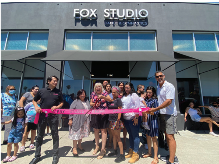
FOX STUDIO DANCE AND GYMNASTICS GRAND OPENING