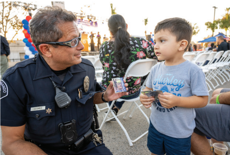
SFPD HOSTS NATIONAL NIGHT OUT