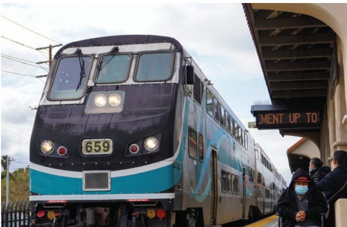
A METROLINK TRAIN ARRIVES AT THE SYLMAR/SAN FERNANDO TRAIN STATION