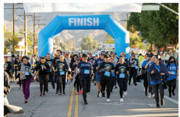
THE SAN FERNANDO VALLEY MILE RUN