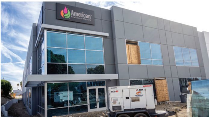
A NEW MANUFACTURING BUSINESS MOVES TO SAN FERNANDO