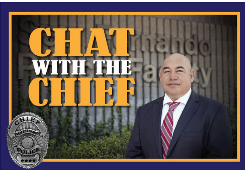
SAN FERNANDO LAUNCHED CHAT WITH THE CHIEF