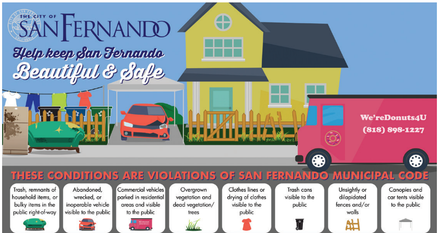
A POSTCARD SENT TO RESIDENTS EDUCATES THEM ABOUT THE ACTIONS TO AVOID TO KEEP SAN FERNANDO BEAUTIFUL AND SAFE