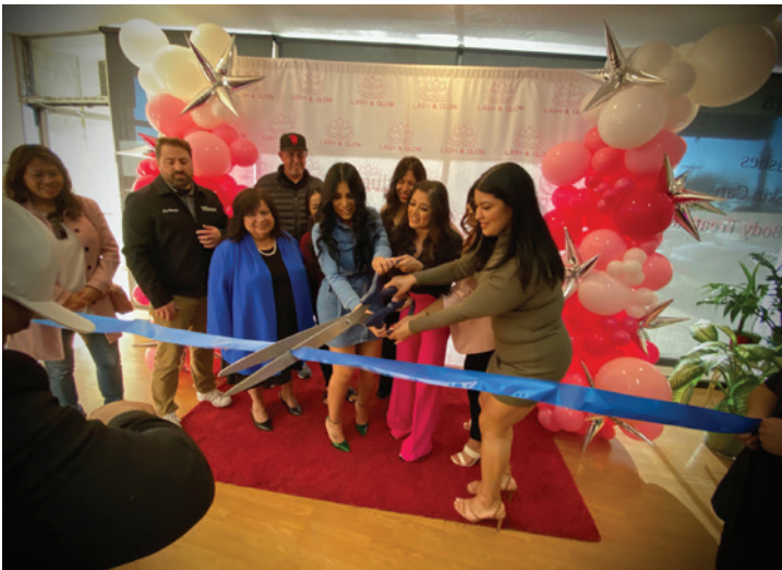
LASH AND GLOW GRAND OPENING