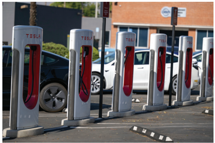
TESLA ELECTRIC VEHICLE SUPER CHARGER STATIONS IN A PARKING LOT IN SAN FERNANDO