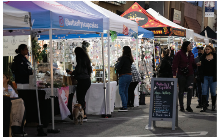
THE SAN FERNANDO OUTDOOR MARKET