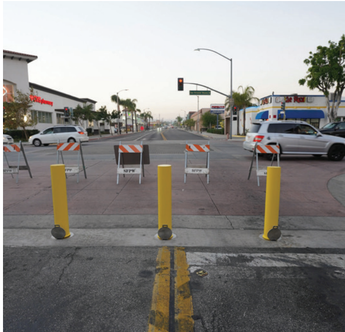
IN-GROUND BOLLARDS CREATE A NEW WALKING ENVIRONMENT