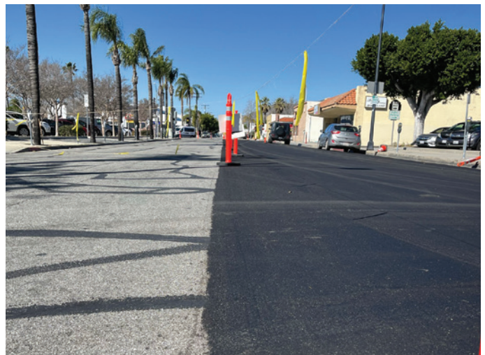
A RESURFACING PROJECT IMPROVED A CITY STREET