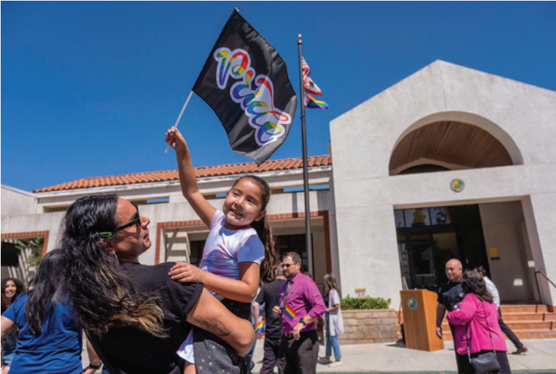
PRIDE FLAG RAISING EVENT