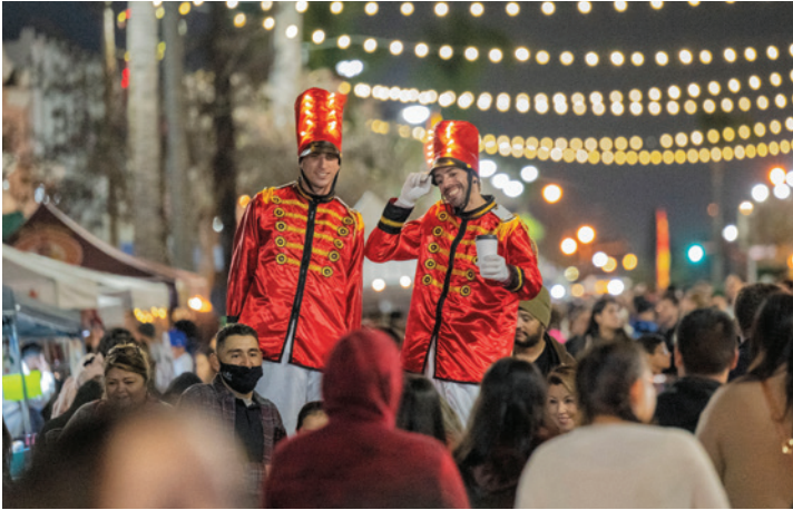
SAN FERNANDO TREE LIGHTING EVENT