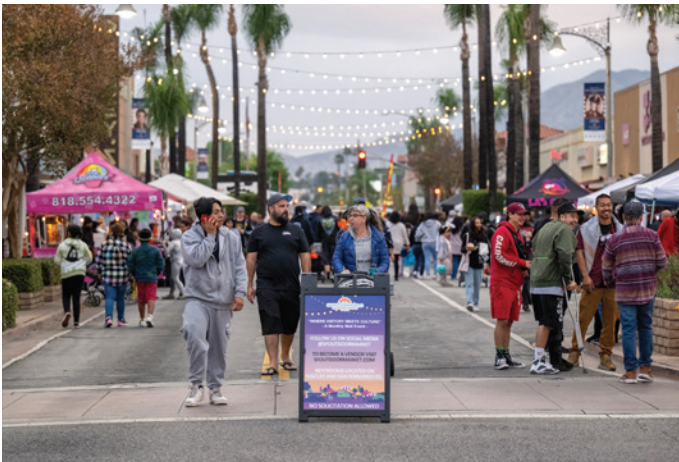
THE SAN FERNANDO OUTDOOR MARKET

With the completion of the new 165,000-square-foot American Fruits and Flavors headquarters building, the City attracted over 300 new jobs to the area.