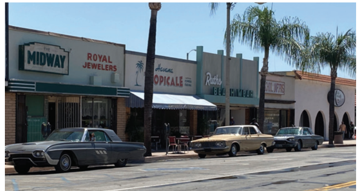
FILMING IN DOWNTOWN SAN FERNANDO