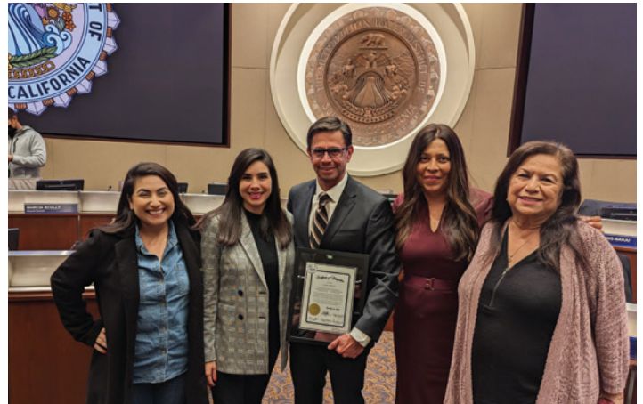
METROPOLITAN WATER DISTRICT BOARD OF DIRECTORS CHAIRMAN ADAN ORTEGA WITH SAN FERNANDO CITY COUNCIL MEMBERS

Through a grant and partnership with TreePeople, the City planted 245 street trees to help reduce the heat island effect in San Fernando (street trees are trees planted in the public right-of-way, such as between a curb and a sidewalk). The City also updated the turf replacement regulations to align with regional goals to reduce water use while maintaining aesthetically pleasing design.