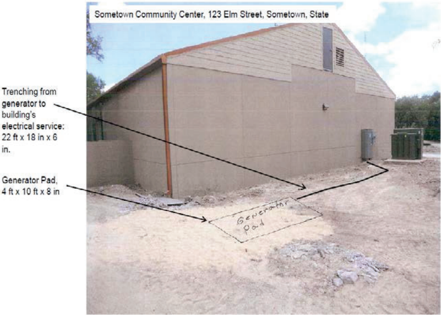
Figure 4. Ground-level photograph showing proposed ground disturbance area.

Ground-level photograph with excavation area close-up. The example in Figure 4 shows the proposed location for the concrete pad for a generator and the ground disturbance to connect the generator to the building's electrical service. This information can be illustrated with either an aerial or ground-level photograph, or both. This example has the name and physical address of the project site.