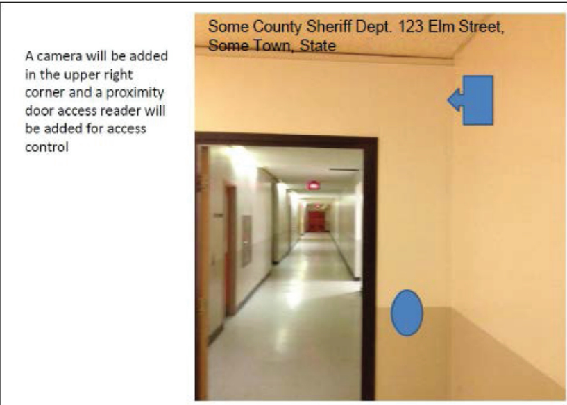
Figure 6. Interior photograph showing proposed location of new equipment.

Interior equipment photographs. The example in Figure 6 shows the use of graphic symbols to represent security features planned for a building. The same symbols are used in the other pictures where the same equipment would be installed at other locations in/on the building. This example includes the name of the facility and its physical address.