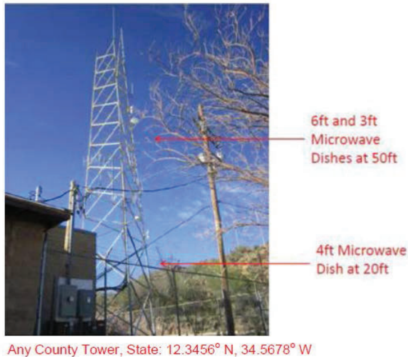
Any County Tower, State: 12.3456° N, 34.5678° W

Communications equipment photographs. The example in Figure 5 supports a project involving installation of equipment on a tower. Key elements are identifying where equipment would be installed on the tower, name of the site and its location. This example provides site coordinates in decimal format.