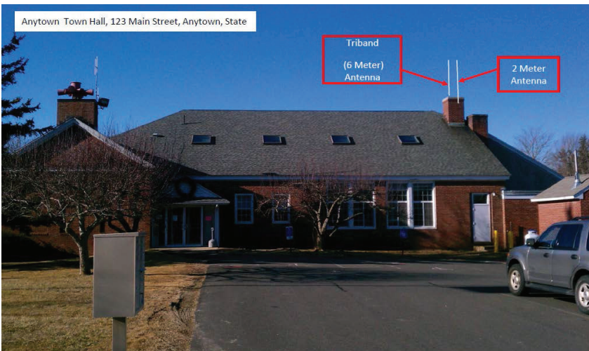
Figure 2. Example of ground-level photograph showing proposed attachment of new equipment.

Ground-level photographs. The ground-level photograph in Figure 2 supplements the aerial photograph in Figure 1, above. Combined, they provide a clear understanding of the scope of the project. This photograph has the name and address of the project site, and uses graphics to illustrate where equipment will be installed.